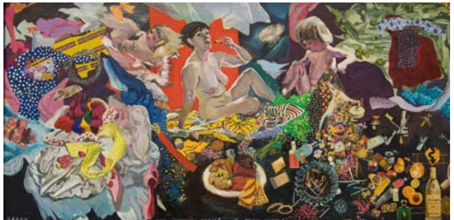
ABOVE: JACQUELINE FAHEY - FINAL DOMESTIC EXPOSE - I PAINT MYSELF, 1981-1982, oil and collage on board, Auckland Art Gallery Toi o Tamaki, purchased 1983