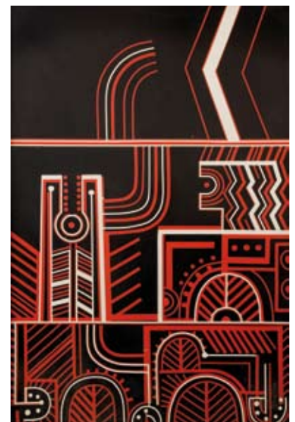
RIGHT: PARA MATCHITT - UNTITLED, TE KOOTI SERIES, 1969, lacquer on board, Auckland Art Gallery Toi o Tāmaki