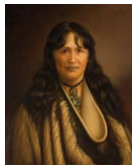
ABOVE: GOTTFRIED LINDAUER - TE PAEA HINERANGI (GUIDE SOPHIA), 1896, oil on canvas, Auckland Art Gallery, gift of Mr H.E. Partridge, 1915

With your friends and family revel in the luscious beauty of food and the tactile sensual qualities of art at "TASTE: FOOD AND FEASTING IN ART", a mouth-watering experience not to be missed. The exhibition runs from 21 November 2009 to 14 February 2010.