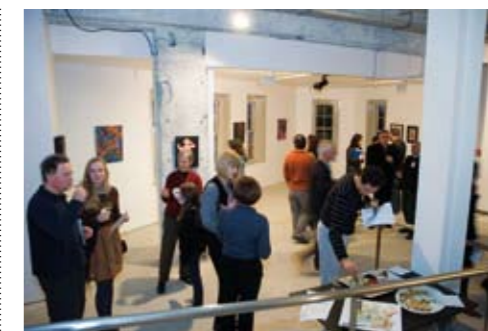
LEFT: St Paul St Gallery 3

Friday 3 July to Friday 10 July // 11.00am-3.00pm Friends Student Members Exhibition – "Sustainability" "Sustainability", the Friends' Student Art Exhibition, opens on Thursday 2 July at AUT St Paul St Gallery 3. Friends' members are invited to attend the opening and get first pick of the artworks, which are for sale with all profits going directly to our student members. This is a great opportunity to meet and support some of our student members and to enrich your home with an original artwork by an emerging young artist. The exhibition runs until 10 July and is open to Friends' members and the public free of charge. AUT St Paul St Gallery 3, 39 Symonds Street.