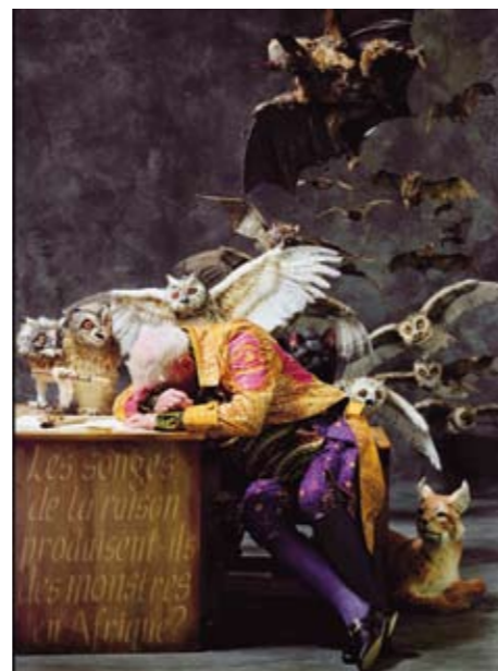
RIGHT: YINKA SHONIBARE - THE SLEEP OF REASON PRODUCES MONSTERS (AFRICA) 2008, type c photograph, courtesy of the artist, James Cohan Gallery, New York and Stephen Friedman Gallery, London © the artist