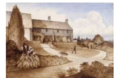
JOHN KINDER (1819–1903) Great Britain. NEW ZEALAND SAINT JOHN'S COLLEGE - 1878. Watercolour and gouache over pencil. Auckland Art Gallery Toi o Tāmaki Purchased 1989