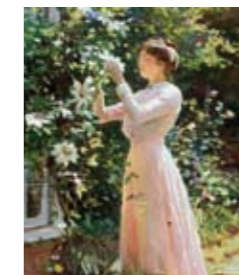
Harold KNIGHT (1874–1961) - Great Britain. WHITE CLEMATIS Oil on canvas. Auckland Art Gallery Toi o Tāmaki Purchased 1912

Art that depicts gardens is rich in symbolism and features in almost all cultures – from highly stylised Islamic representations of the Gardens of Paradise to romantic settings for popular themes in Western art. "The Enchanted Garden", curated by Mary Kisler, brings together works from all parts of Auckland Art Gallery Toi o Tāmaki's collections, as well as contemporary works by New Zealand and international artists, objects from the Auckland Museum, and illustrated texts from the Public Library Special Collections. Exhibition Fee charged. Friends Members discount applies.