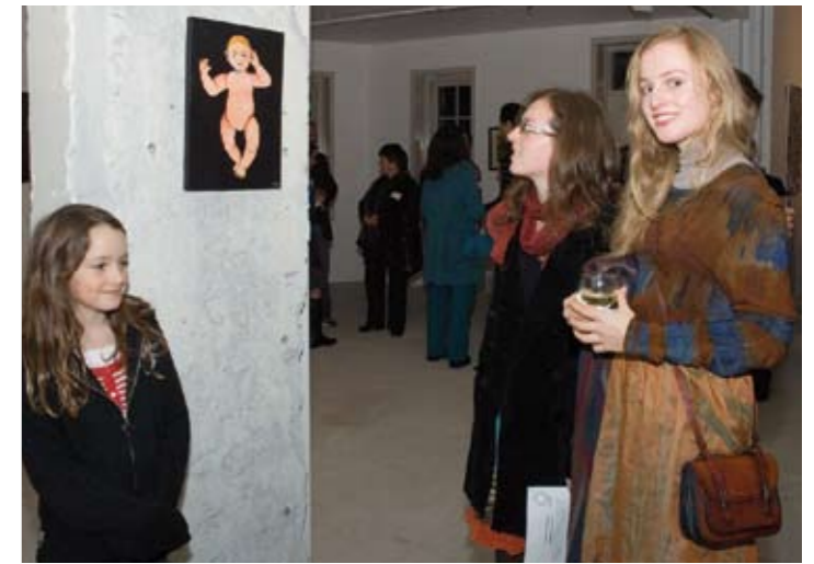
ABOVE & RIGHT: AUT St Paul St Gallery 3

Both annual events are part of our continued effort to engage student members in the Friends and provide a stimulating platform for connecting with emerging young artists.