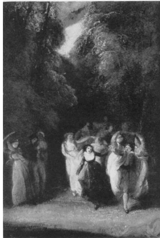
THOMAS STOTHARD, R A (175 v1 834) British A GROUP OF DANCERS