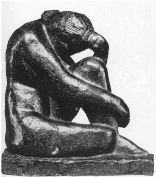
HENRI GAUDIER BRZESKA (1891-1915), British SEATED WOMAN