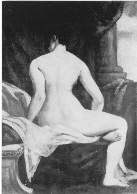
WILLIAM ETTY, RA (1787-1849) British A NUDE

This is the second bronze by this artist to enter the collection.