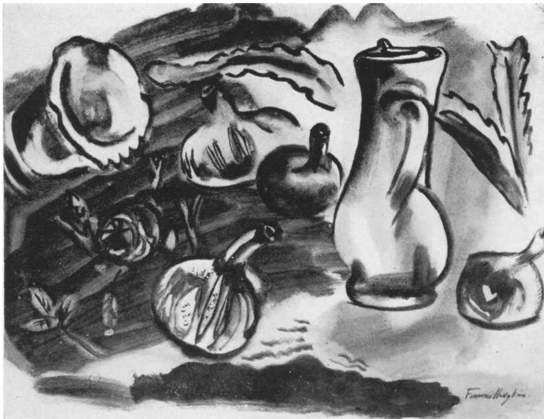
FRANCES HODGKINS (1869-1947) PHOENICIAN POTTERY AND GOURDS