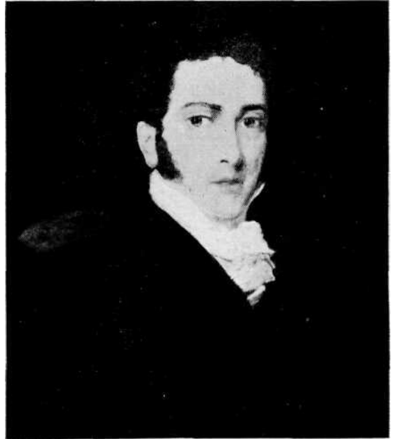
SIR DAVID WILKIE, RA (1785-1841)

SKETCH PORTRAIT OF THE REV EDWARD IRVING (1792-1834)