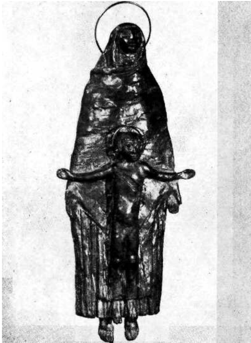
SIR JACOB EPSTEIN Madonna and Child