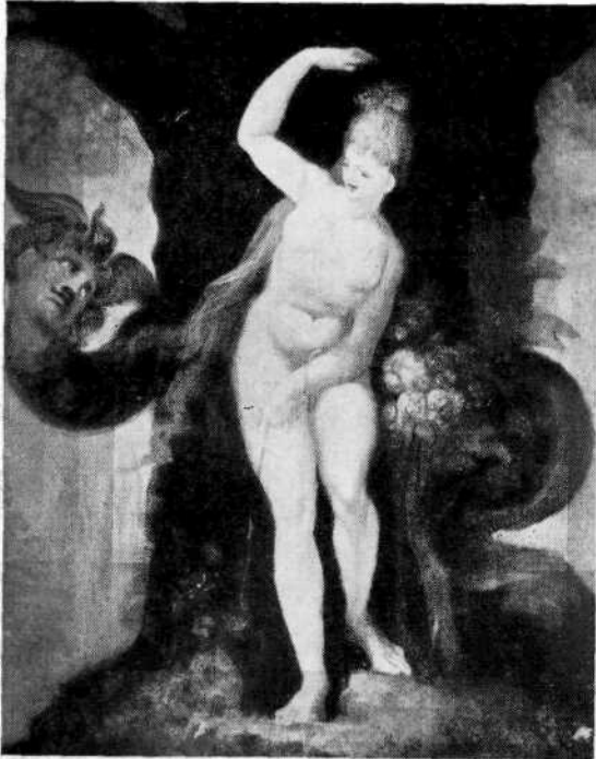
HENRY FUSELI (1741-1825) SATAN'S FIRST ADDRESS TO EVE Oil on panel 11 7/8 x 9 3/8 ins

This painting, from the Sir George Grey Bequest, has always been attributed to Fuseli,