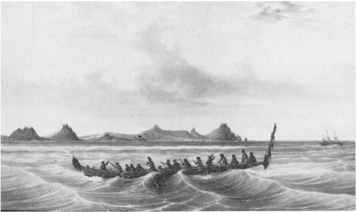
LOUIS DE SAINSON (F). Mid 19th C.) French VIEW OF WHANGAREI HARBOUR Hand coloured lithograph 206 x 3-12 Purchased 1961

This hand-coloured lithograph has been titled, on the stone, Vue du Cap Wangari . De Sainson (born 1801), a special clerk in the Admiralty at Rochefort, was taken on by Dumont D'Urville in the capacity of an artist for the earlier voyage of the Astrolabe , which sailed from Toulon in 1826 and returned to Marseilles in 1829. The publication of D'Urville's journal and notes, the 'Voyage de la Corvette