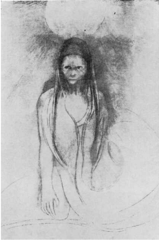
ODILON REDON (18-40-1916) French THE BUDDHA Lithograph 12J x 9|ins Purchased 1961