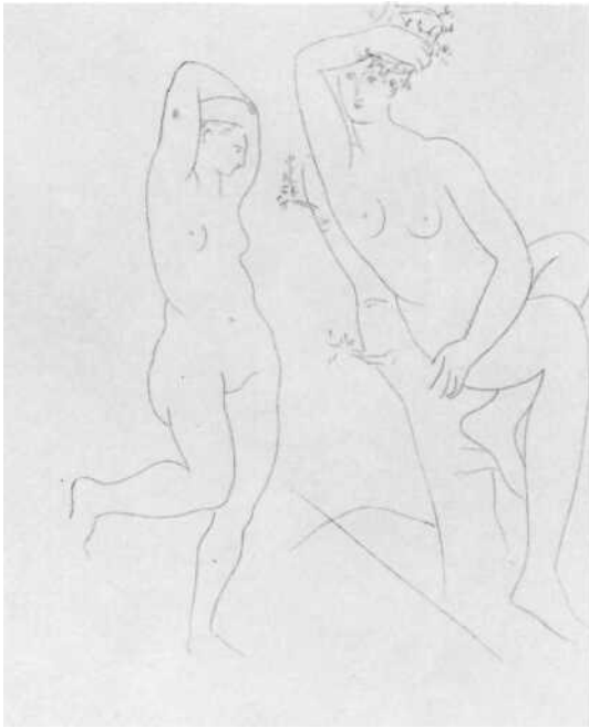
PABLO PICASSO (b. 1881), French DEUX FEMMES NUES DANS UN ARBRE (Two Nude Women in a Tree)