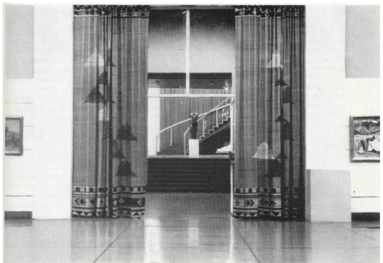
A View Through the Gallery