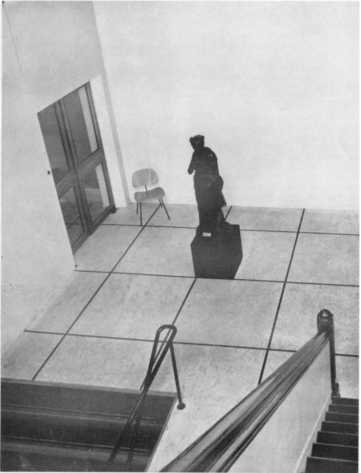
AUCKLAND CITY ART GALLERY